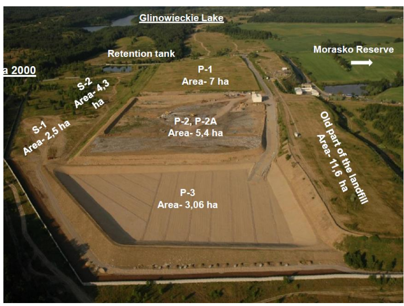
Landfill in Poznan Suchy Las