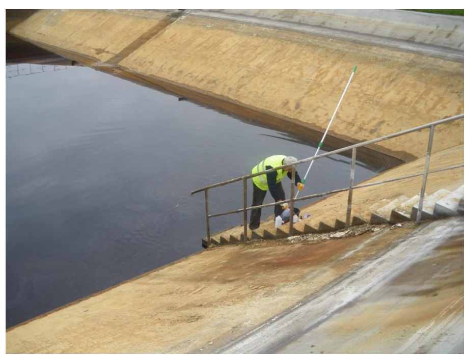
Sampling of leach ate by specialist on sampling of Polish inspectorate

During the inspection samples of the leach ate before and after treatment were taken. The method of sampling was by taking one sample with a measuring cup on a stick. This was done in the retention reservoir (leach ate before treatment) and stabilisation pond (cleaned leach ate water).