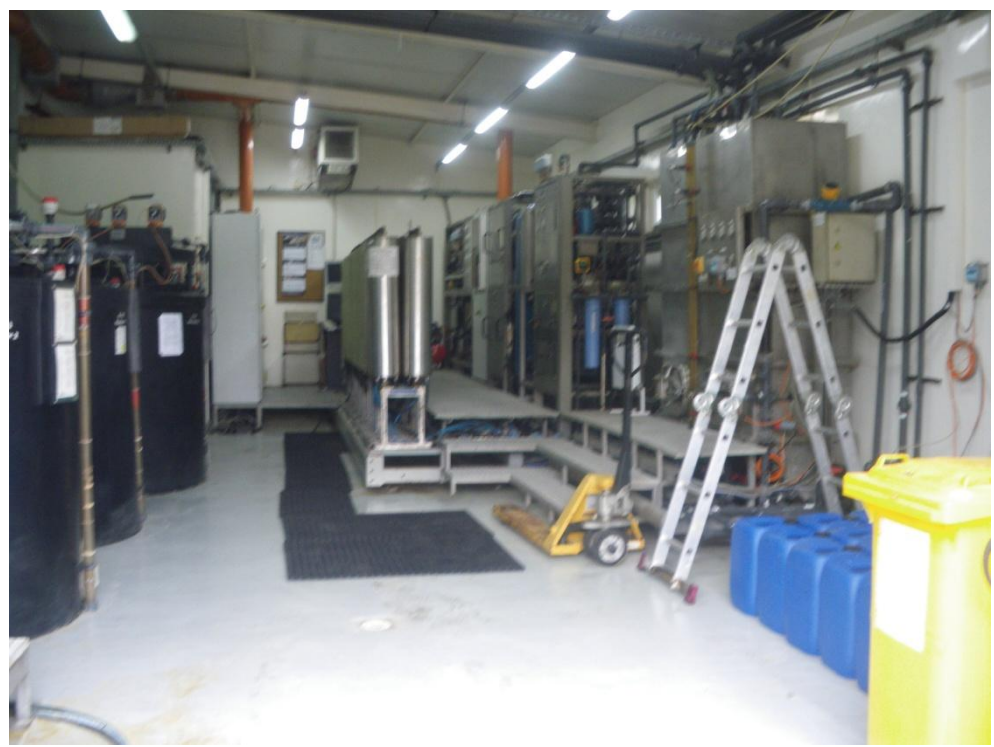
Leach ate treatment plant

After the treatment a cleaned water and a condensed water is produced. The condensed water is returned to the retention reservoir and re-circulated to the reclaimed cells in order to intensify the process of anaerobic digestion and generation of biogas. The clean treated water goes into a stabilisation pond. The water from this stabilisation pond is used for technological processes on the landfill such as in the greenery and washing of the internal roads on the landfill.