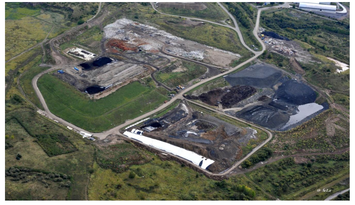
CELIO: localization: Ústecký Region, town: Litvínov, cadastral area: Růžodol