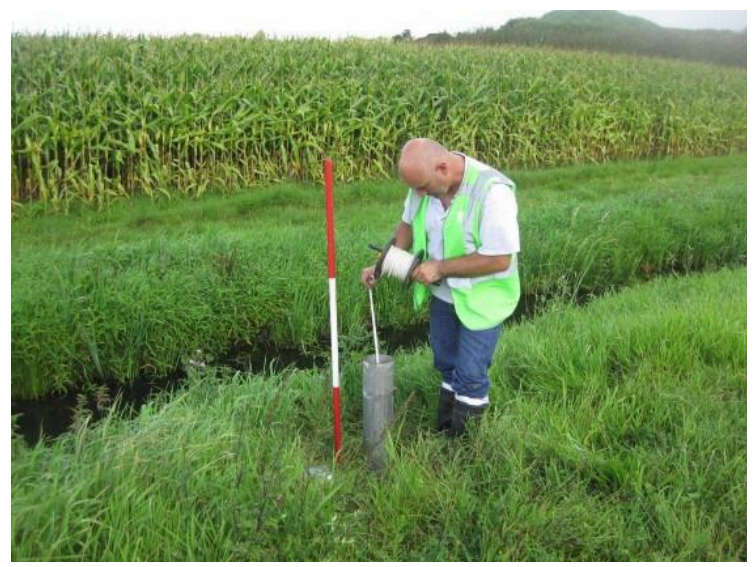
Protection of soil and groundwater