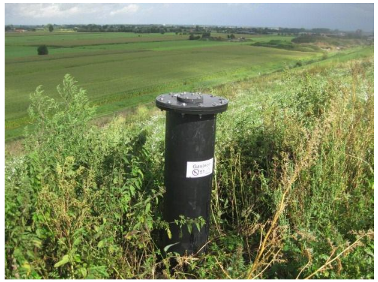
Gas extraction and utilization