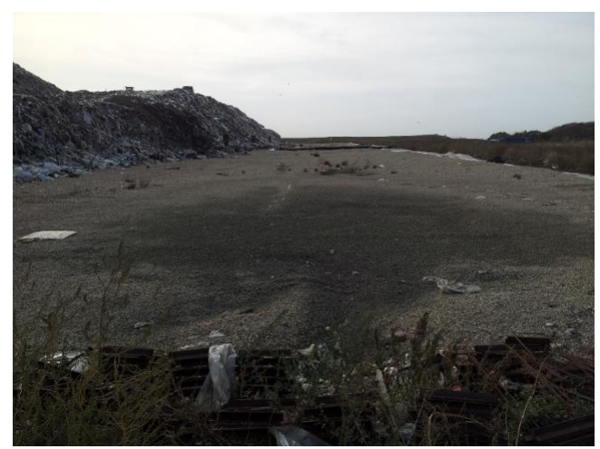
Bottom layer of the landfill