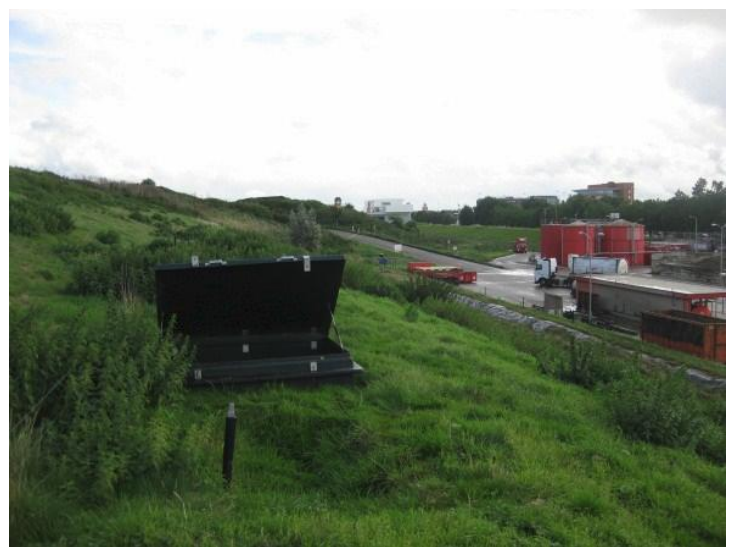
Gas extraction and utilization