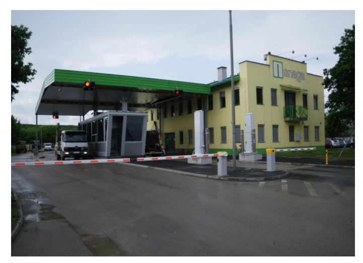
Landfill Barje Snaga