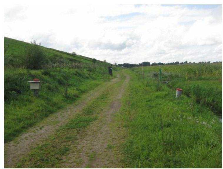
Protection of soil and groundwater