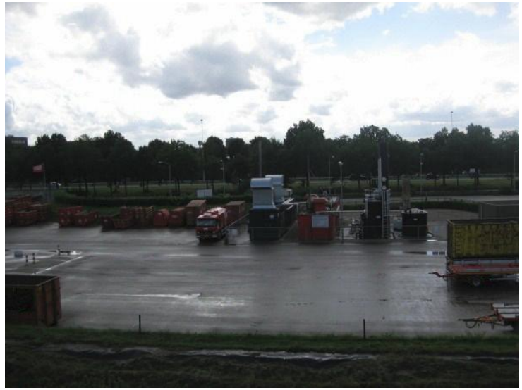
Gas extraction and utilization