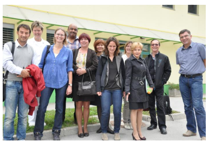
Inspection team in Slovenia