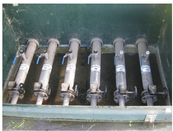
Gas extraction and utilization