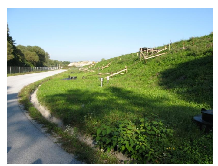
Protection of soil and groundwater