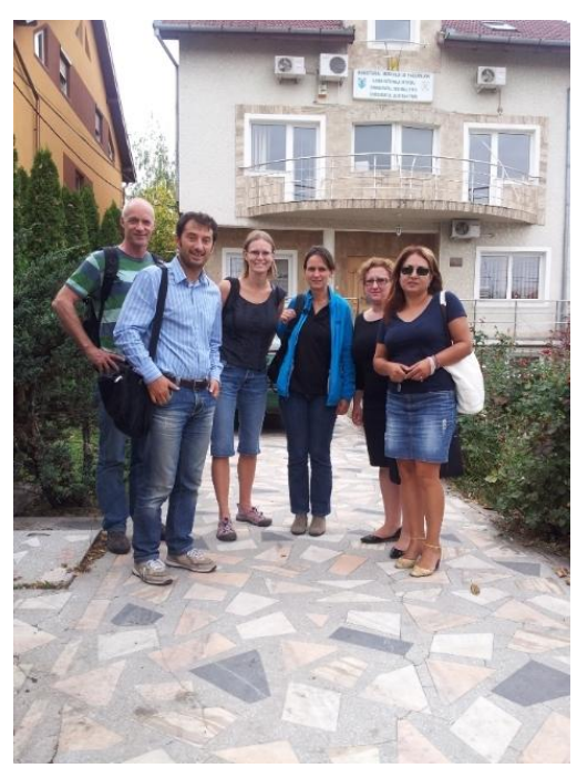
Inspection team in Romania