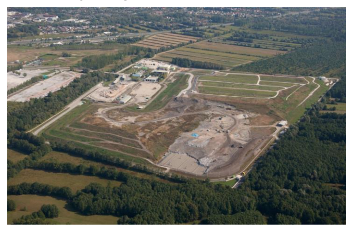
Landfill Barje Snaga