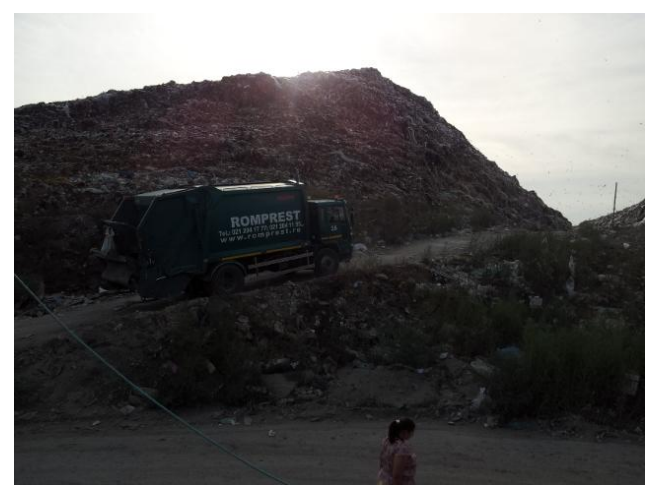
Steepness of slopes