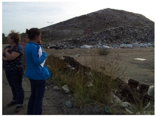
Bottom layer of the landfill