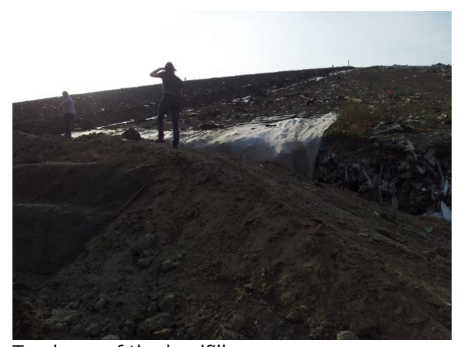
Top layer of the landfill