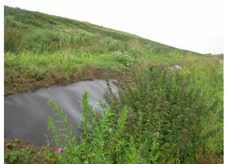
Protection of soil and groundwater