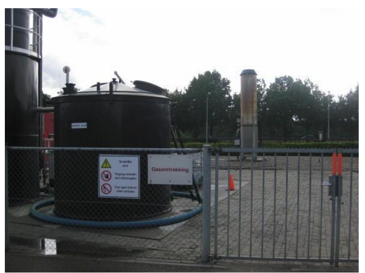
Gas extraction and utilization