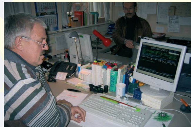
Presentation of ZAPP digital database at the Water Police station in Hamburg seaport

The joint inspection began with a visit to the Water Police station in Hamburg seaport. They showed their ZAPP digital database (i.e. Custom Export – Monitoring in a Paperless Port) which is used by the German Customs Service. The Water Police also has access to the database and can suggest the execution of certain inspections of doubtful shipments.