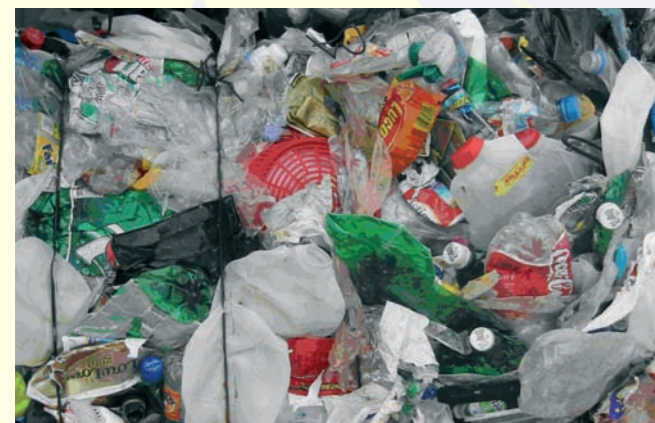
Domestic waste or plastic waste? Shipment from Scotland to China, detected in Rotterdam and considered as green listed plastic waste