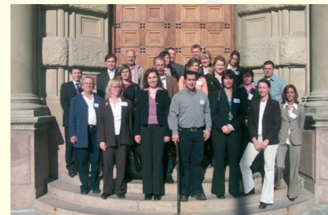
Participants interim meeting, Stockholm

New ambitions for the second half of the operational phase of the project have been formulated at the interim meeting as well. Also agreements have been made about the exchange of inspectors.