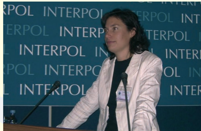
Presentation IMPEL-TFS Seaport II project at the Interpol conference

During her presentation she informed the participants about the results of the first IMPEL-TFS Seaport project and the progress of the second project.